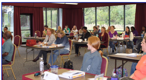
Kids At Hope Trainer Academy attendees.