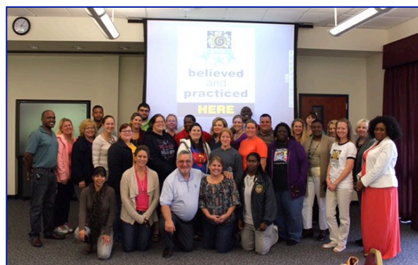
The Kids At Hope Trainer Academy Graduates!