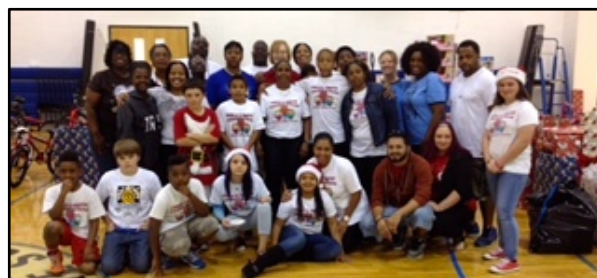
Volunteers for the 2014 Toy Giveaway hosted by the Viola G. Smith Foundation and SLC Roundtable.