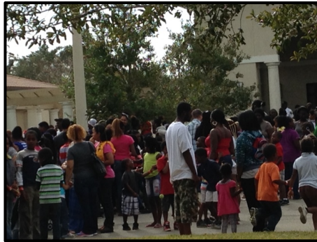
More than 500 residents served at the Toy Giveaway.