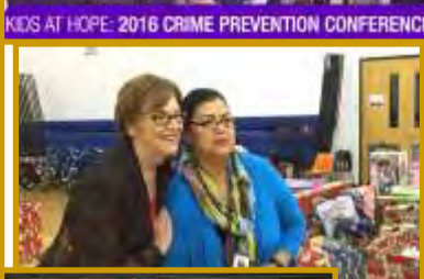
KIDS AT HOPE: 2016 CRIME PREVENTION CONFERENCE