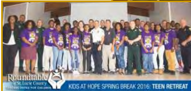
Roundtable of St. Lucie County LEADERS UNITED FOR CHILDREN KIDS AT HOPE SPRING BREAK 2016: TEEN RETREAT