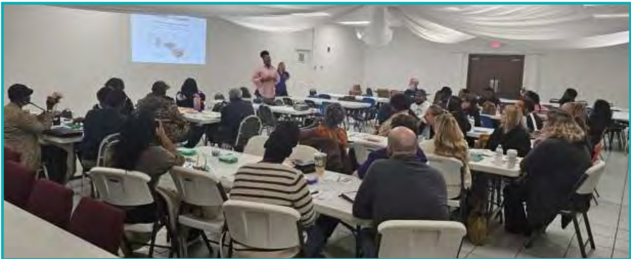
Trauma-Informed Care Training

For more information on the St. Lucie RISE Mental Health Collaborative, visit the initiative page at www.roundtableslc.org/stlucie_rise and follow us on Facebook @StLucieRISE.